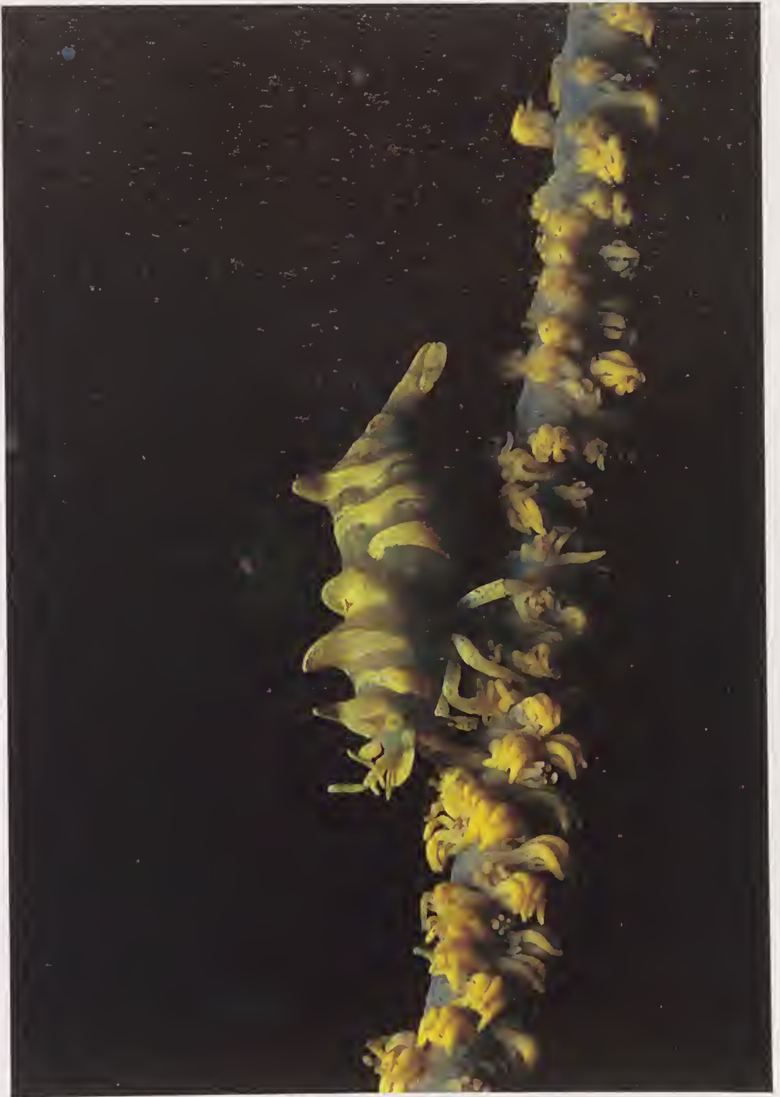
Plate 1. Miropandatus hardingi Bruce, ovigerous female, Izu Marine Park, Honshu, Japan, 20m, on Ciripathes sp..